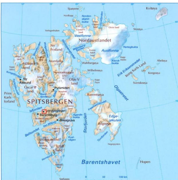
Figure 1 Overview map of the Svalbard Archipelago ([5]).

The drilling campaign took place at Svalbard in Longyearbyen (see Figure 1). The location of the soil investigation was at the building No.33 in road 236 as shown in Figure 2. Approximate location of the two boreholes made during fieldwork is shown in Figure 3.