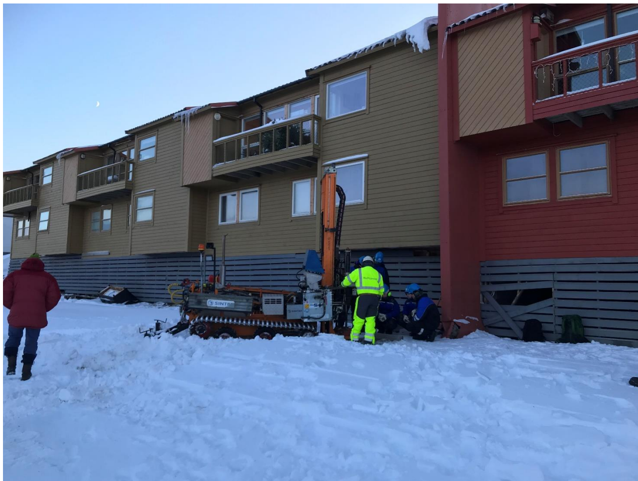
Figure 4. Fieldwork at the building No.33 in road 236.