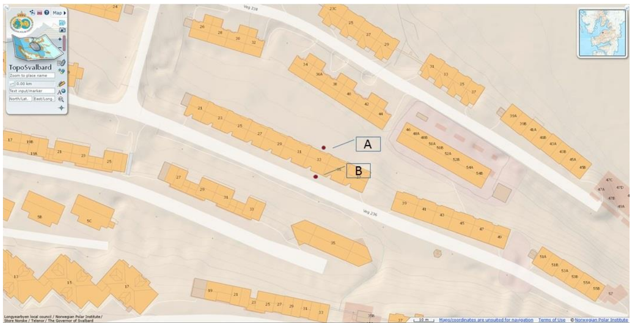
Figure 3. Approximate location of boreholes at the building No.33 in road 236 ([6]).