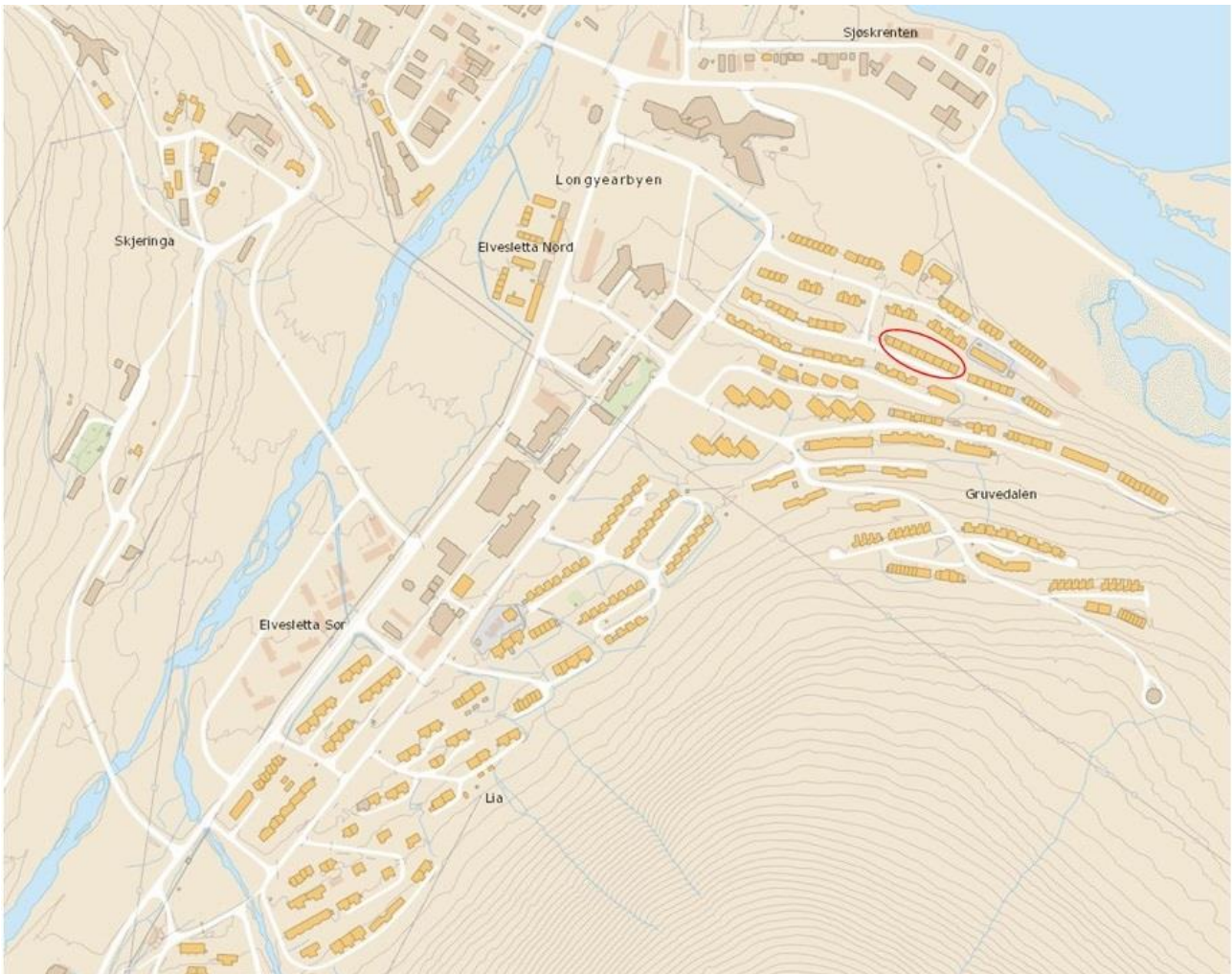
Figure 2. Location of the site in Longyearbyen ([6]).